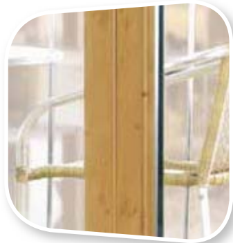
Gaskets are hidden with a patented trim