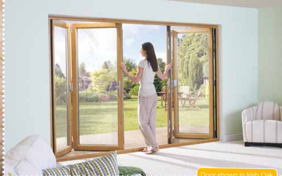
Door shown in Irish Oak