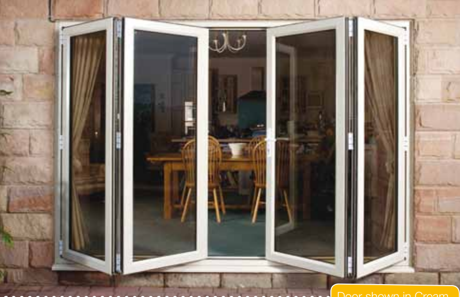
Door shown in Cream