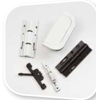
Bespoke British designed hardware