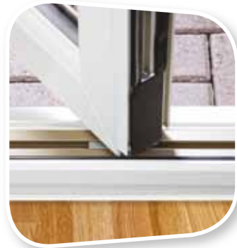
Aluminium roller track