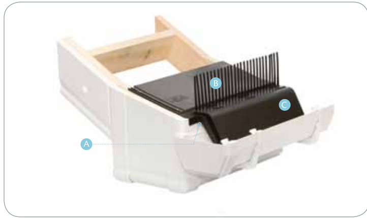
A roofline sample showing the 3 in 1 accessory used to enhance your roofline solution ▲