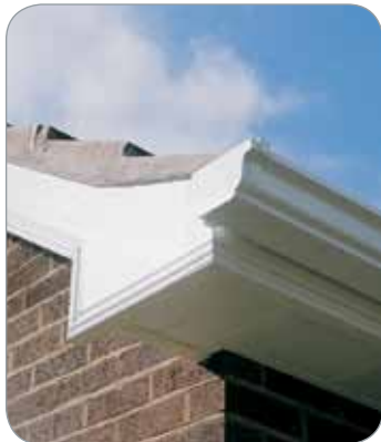
▲ Decorative Ogee style fascia boards in White finish