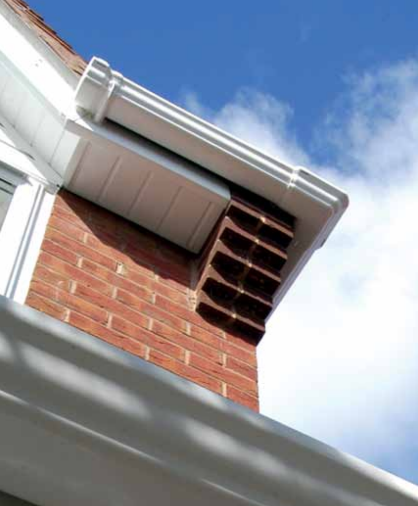
▲ Standard fascia board in White, along with White hollow soffit boards