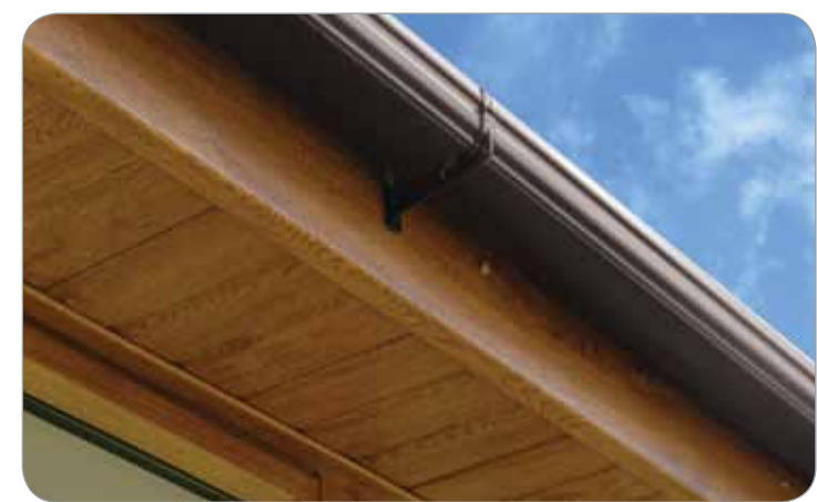
▲ Universal Plus guttering shown in Brown

Cream-coloured guttering is available exclusively from Eurocell in the Universal Plus style, while ogee styling gives you the option of a more decorative, sculpted finish.