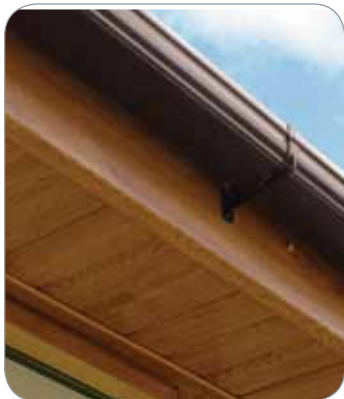
▲ Property with standard fascia boards in Golden Oak finish

You can also choose plain flat boards for a simple, contemporary look, or sculpted 'ogee' style options for a more decorative finish.