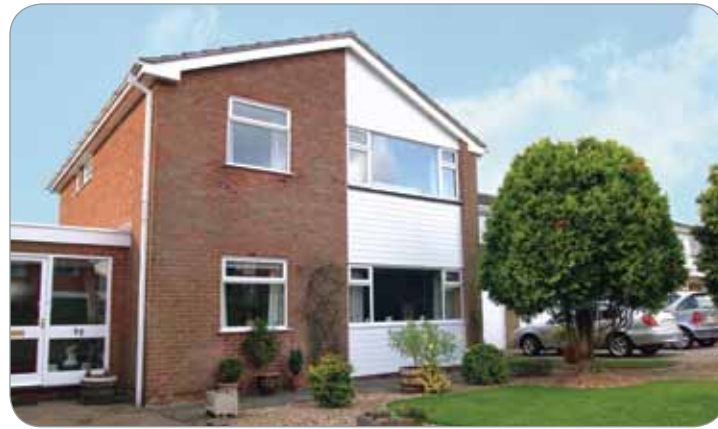
▲ Shiplap cladding in a horizontal formation, in White finish

In addition to these individually available items, there is a 3 in 1 solution (as shown above) which combines: A Over-fascia ventilation which sits underneath the felt tray, B Eaves comb filler and C In-built felt tray which prevents the roof felt from sagging and stops pools of water from forming.