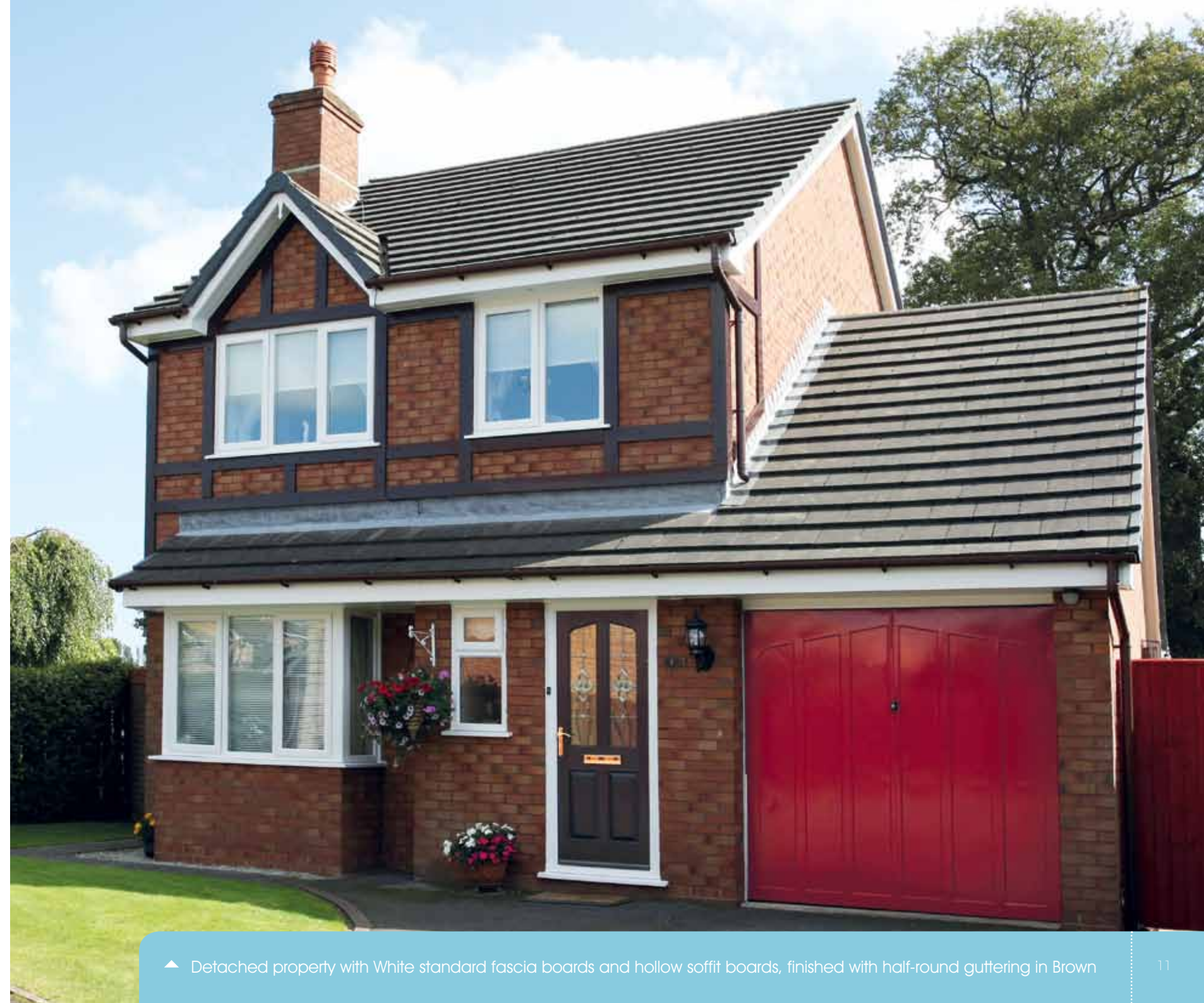
▲ Detached property with White standard fascia boards and hollow soffit boards, finished with half-round guttering in Brown