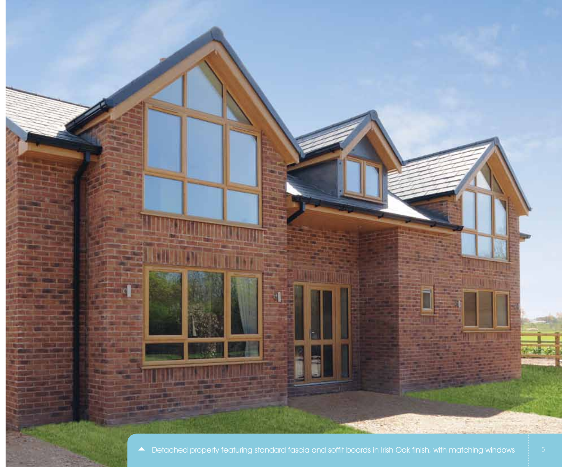
▲ Detached property featuring standard fascia and soffit boards in Irish Oak finish, with matching windows

White PVC-U roofline products come with a 20-year guarantee against discolouration, warping and cracking. Coloured, laminated boards carry a ten-year colour-fastness guarantee.