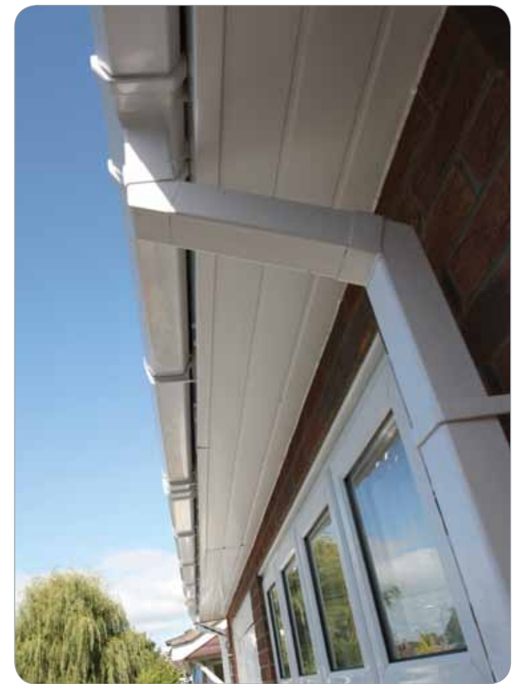
▲ Square-line guttering shown in White