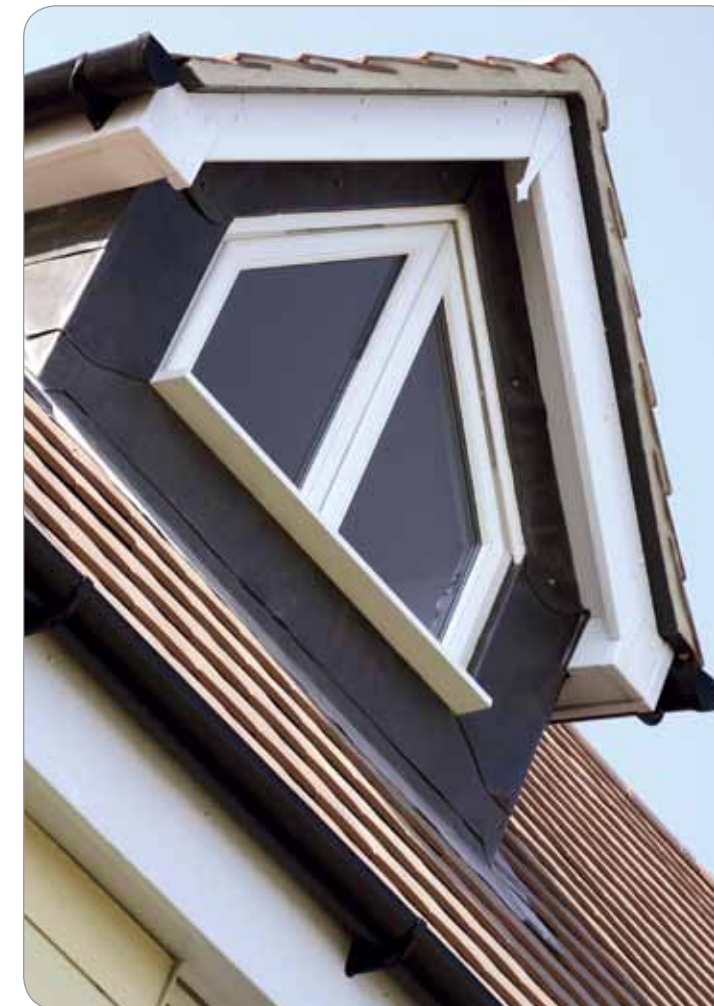
▲ Standard fascia boards and utility boards in White, featuring decorative finial